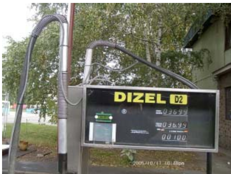
Fig. 3 ID card reader's antenna