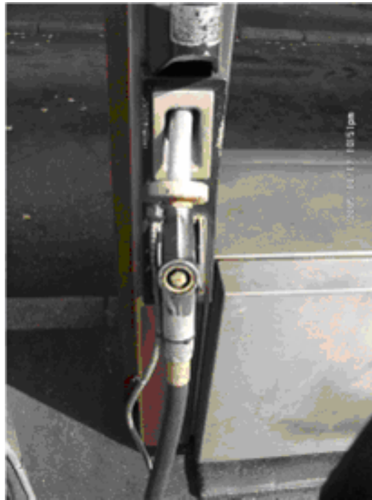
Fig.2 Pump nozzle with antenna for vehicle identification