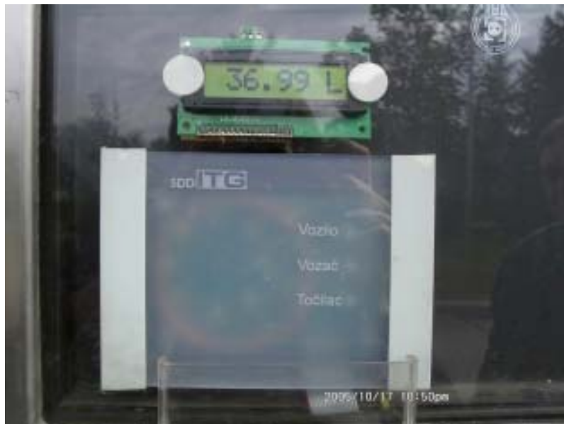
Fig. 4 Detailed view of ID card reader's antenna