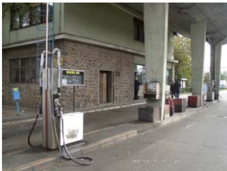
Fig 5. Gas station of the company JGSP "Novi Sad"