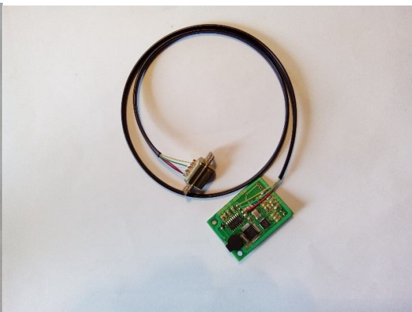
Fig. 2 OEM RFID reader